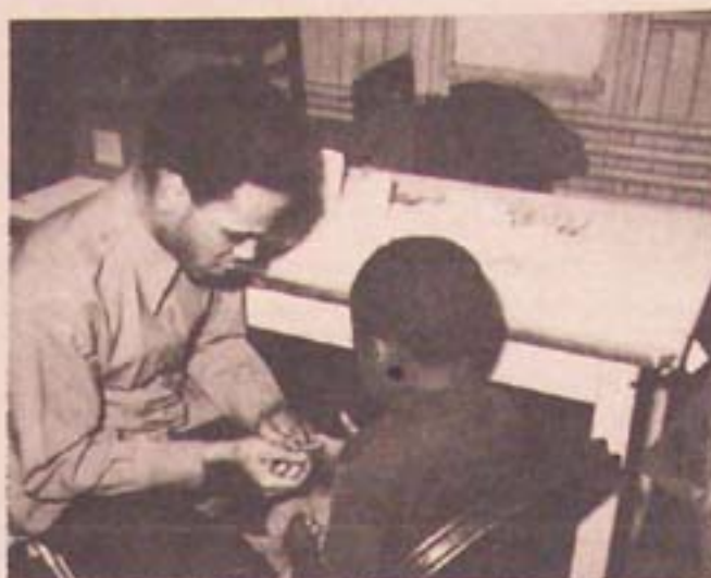
Members of the Black Panther Party (Illinois State Chapter) and community volunteers have, for nearly a year now, been waging a vigorous campaign to fight Sickle Cell Anemia. (Shown here screening and testing one of over 7,000 people, in the Chicago Area alone, who have benefitted from the free tests.)