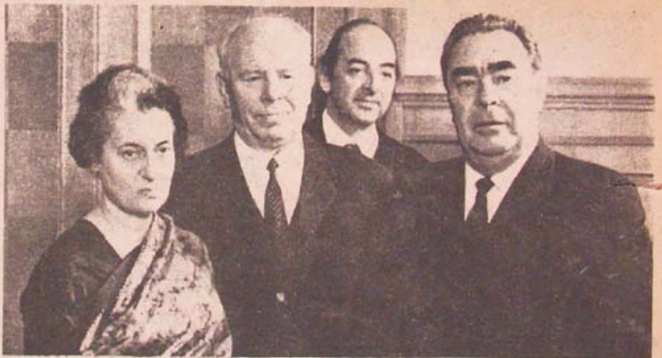
Indira Gandhi made her choices sometime ago. Over three billion dollars in Soviet aid and a so-called treaty with Russia in August, 1971, sealed the fate of the people of East Pakistan.

India's first lady, Prime Minister Indira Gandhi, had decided early last