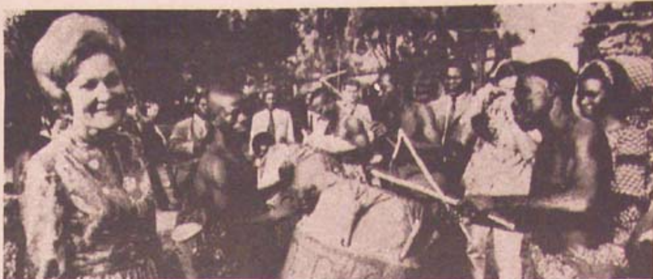
Of her visit to the oppressed communities of Liberia, Ghana, and Ivory Coast, she bubbled, "It's like vacationland...It's just great to be here."