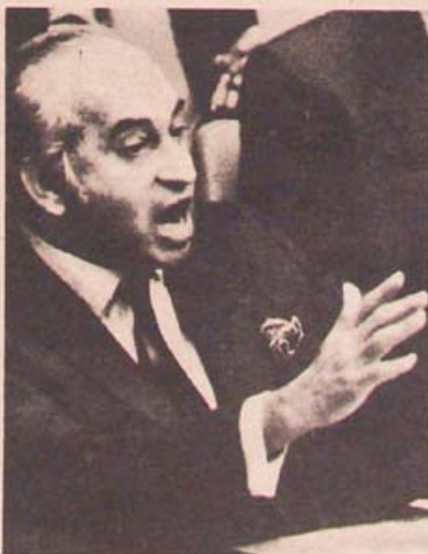
ZULFIKAR ALI BHUTTO, as Pakistan's new President, has already launched progressive programs to serve the basic needs of the People.

We shall see what a so-called independent "Bangla Desh" means after U.S. aid and Soviet domination have finished. We think the people will still suffer. Inside Pakistan, however, attempts are being made to save what pseudo-humanitarians are not torn asunder. Directly after war's end, Yahya Khan was ob-