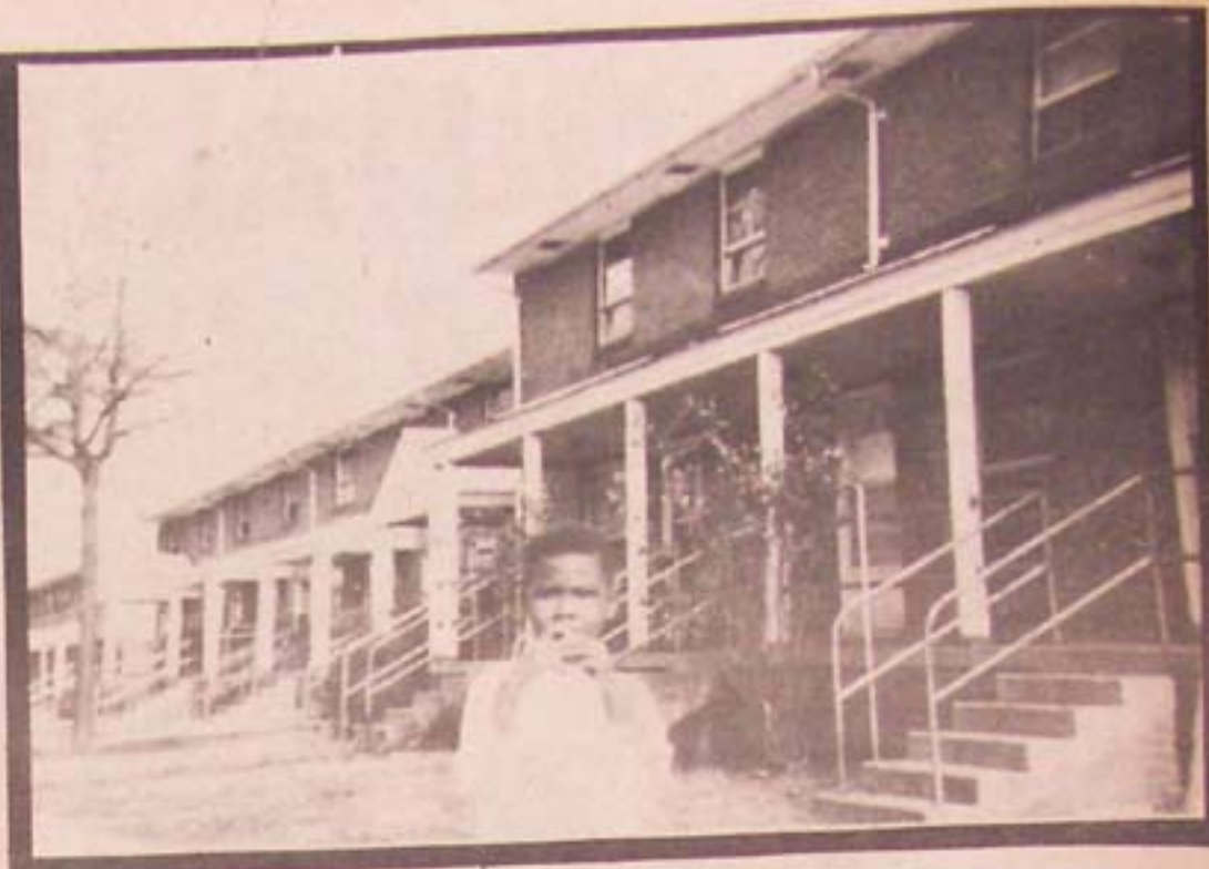
With such unity, the WRO has been able to meet further community needs. They took over an unused welfare department trailer, which is now used to go throughout the community, testing for Sickle Cell Anemia.