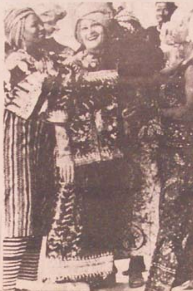
Patty Nixon's "State Tour" of three African countries marked the introduction of a new style in American Fascism - the "feminine" touch.

The next stop in her oppressive "good will" tour was Ghana. Fifteen years earlier she and her husband (who was then vice-president) had