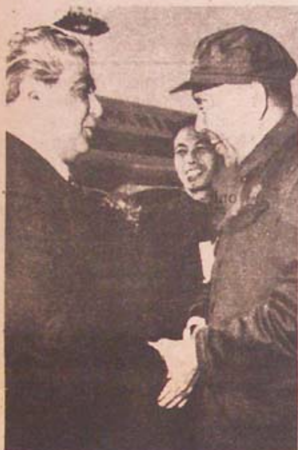
Yahya Kahn's northern neighbors, in the People's Republic of China, were aware that affairs of Pakistan were the business of the whole Pakistani People.