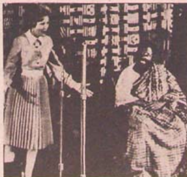
As U.S. President Nixon's official representative, Pat Nixon's visit served the Empire's usual racist, imperialist interests.

been there, under the Eisenhower regime (then U.S. president). That had been the beginning of the period when a U.S. -C.I.A. plot to depose Comrade President Kwame Nkrumah was hatched. Nkrumah was leading his people toward a progressive socialist life and government. Prime Minister Dr. Kofi A. Busia, who greeted Patty for this trip, had come to power as an active participant in the so-called coup that deposed Kwame Nkrumah. (Little did Busia know, however, that ten days after Pat would leave Ghana, he too would be deposed in another "coup".)