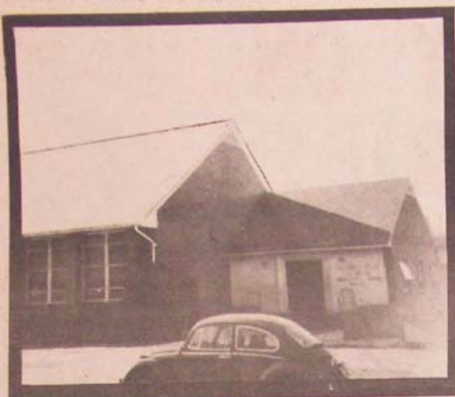
The Kimberly Projects Tenants Council now shares its offices with the WRO. Together, they are taking positive steps to insure the survival of the entire Black Community.